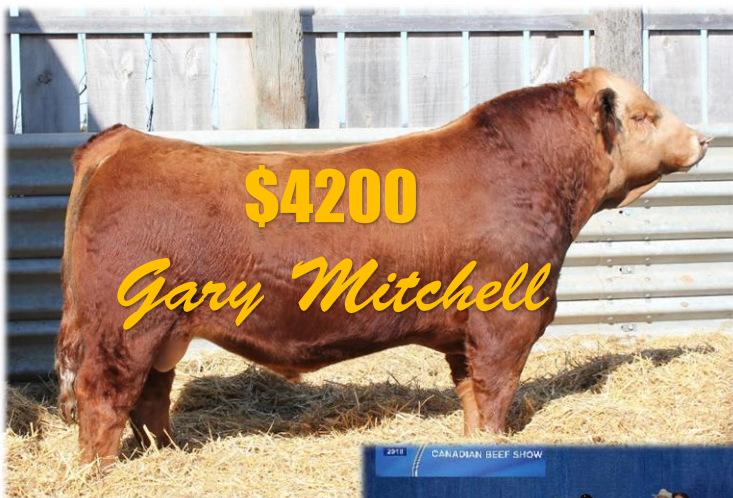
Dam & Maternal Sister Of Lot 210

A really nice bull, from a maternal powerhouse! The Xtreme cow never fails, and sired by the popular Broker bull. 209E is moderate, thick, long & an easy keeper!. Check this guy out!